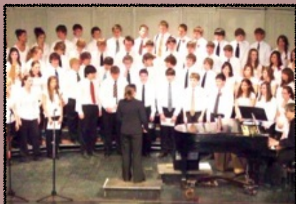
JUNIOR HIGH WINTER CONCERT Tuesday, December 8 @ 7:00pm