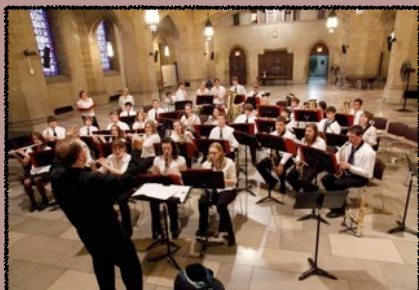
HIGH SCHOOL WINTER CONCERT Wednesday, December 2 @ 7:00pm