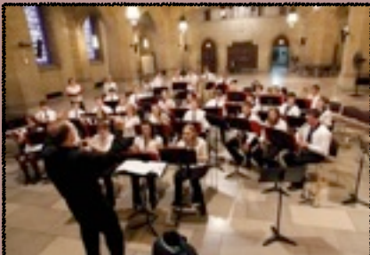
HIGH SCHOOL WINTER CONCERT Wednesday, December 2 @ 7:00pm