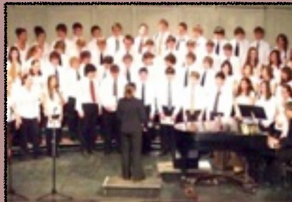
JUNIOR HIGH WINTER CONCERT Tuesday, December 8 @ 7:00pm